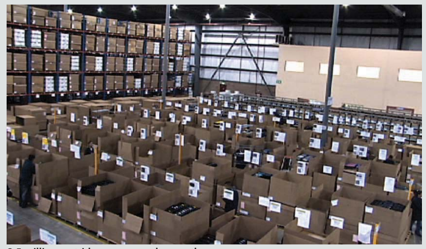
2.5 million cartridges processed a month

6. New Product Development New product is created utilizing post consumer waste which completes the closed loop process.